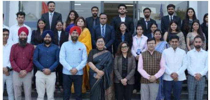
GIL Internship Fair was Organised on Under the Theme "PRASHIKSHAN 4.0"