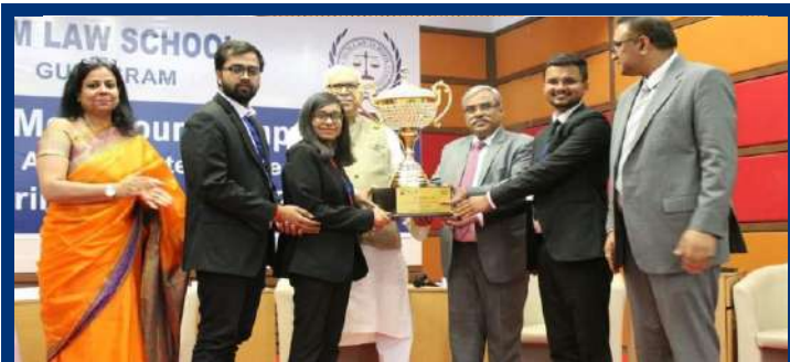
Our Students Runner up at IILM National Moot Court Competition, Gurugram (2022)