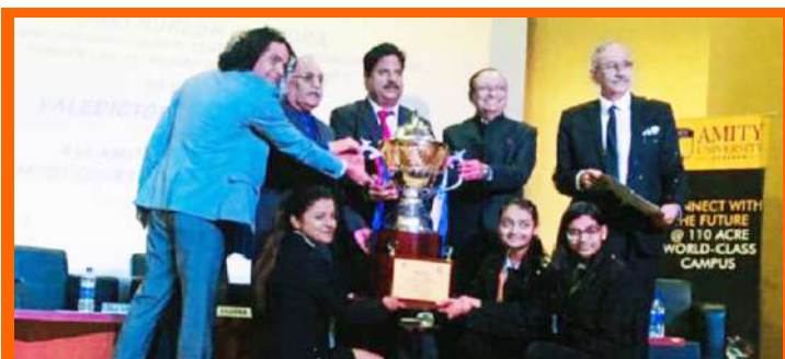
Our Students Winners at Amity University, Gurugram (2019)