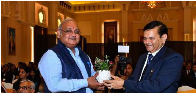
Hon'ble Mr. Justice Dinesh Maheshwari Judge, Supreme Court of India