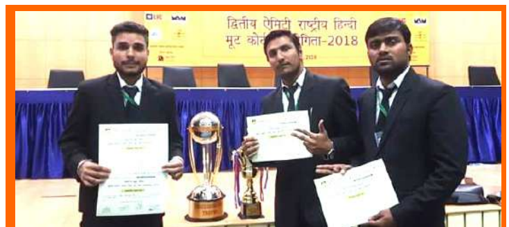
Our Students Winners at Amity University, Noida (2018)