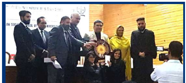
Our Students Winners at University of Kashmir (2018)