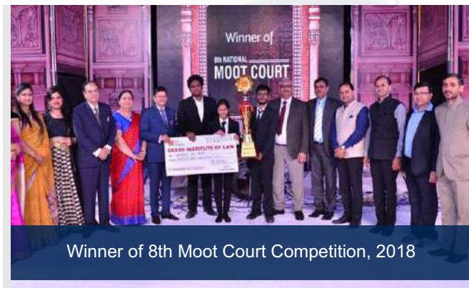
Winner of 8th Moot Court Competition, 2018