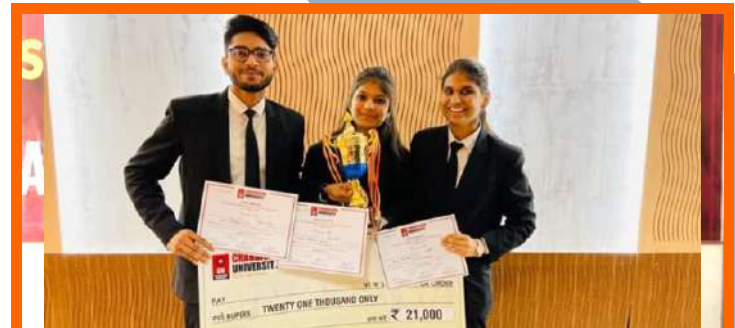
Our Students Runner up at Chandigarh University, Mohali (2019)