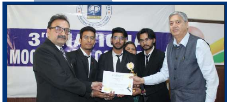
Our Student Semi-Finalists at Career Point University, Hamirpur