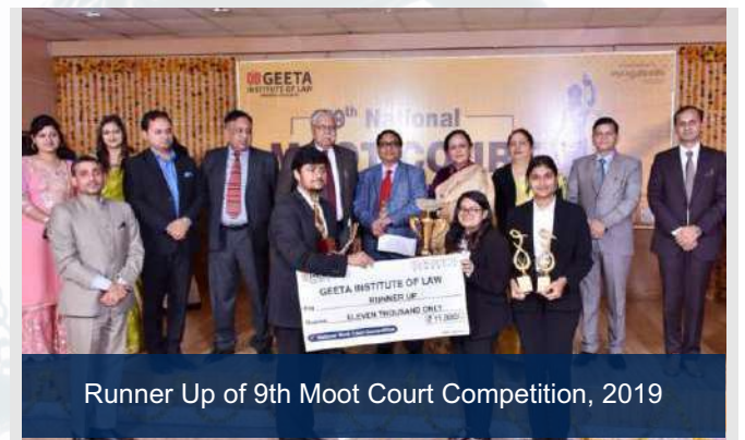
Runner Up of 9th Moot Court Competition, 2019