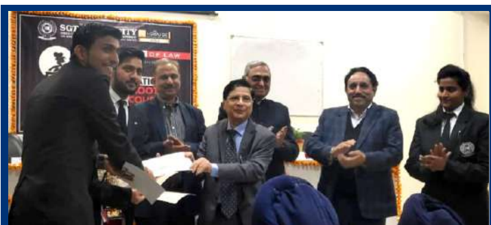
Our Students Winners at SGT University, Gurugram (2019) Receiving Trophy from Hon'ble Mr. Justice Dipak Misra Former CJI