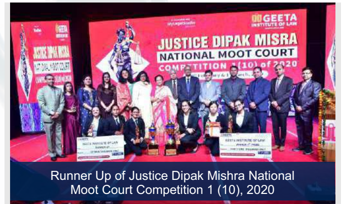
Runner Up of Justice Dipak Mishra National Moot Court Competition 1 (10), 2020