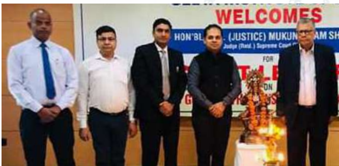
Hon'ble Mr. Justice Mukundakam Sharma, Judge (Retd.) Supreme Court of India