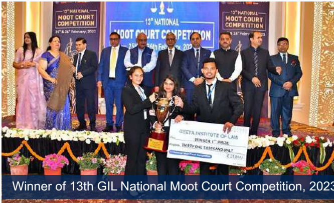
Winner of 13th GIL National Moot Court Competition, 2023