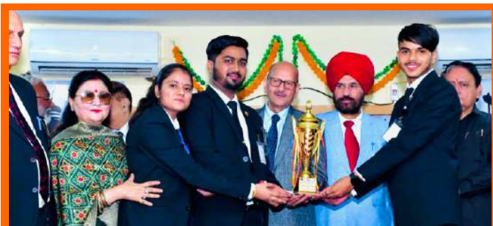
Our Student Semi-Finalists at St. Soldier's Law College, Jalandhar

GIL Moot Court Society very actively organizes workshops for students to train them for National Moot Court Competitions. As a result, Geeta Institute of Law has won Five National Moot Court Competitions at various Colleges and Universities.