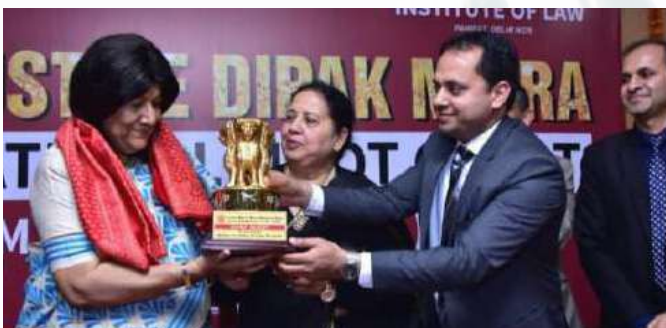
Hon'ble Ms. (J.) Indira Banerjee, Judge Supreme Court of India