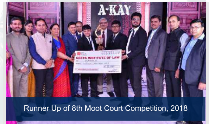
Runner Up of 8th Moot Court Competition, 2018