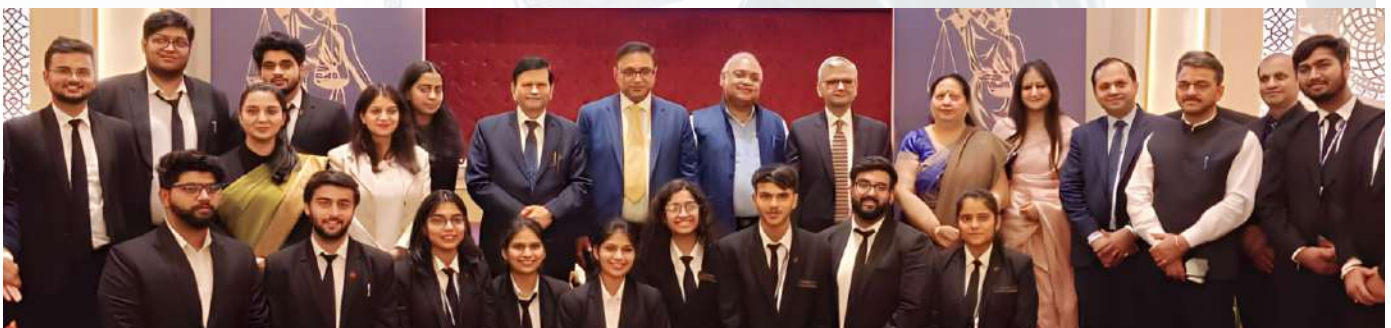
13th GIL National Moot Court Competition, 2023