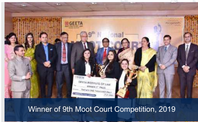
Winner of 9th Moot Court Competition, 2019