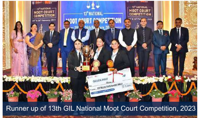
Runner up of 13th GIL National Moot Court Competition, 2023