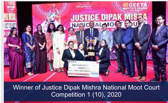
Winner of Justice Dipak Mishra National Moot Court Competition 1 (10), 2020